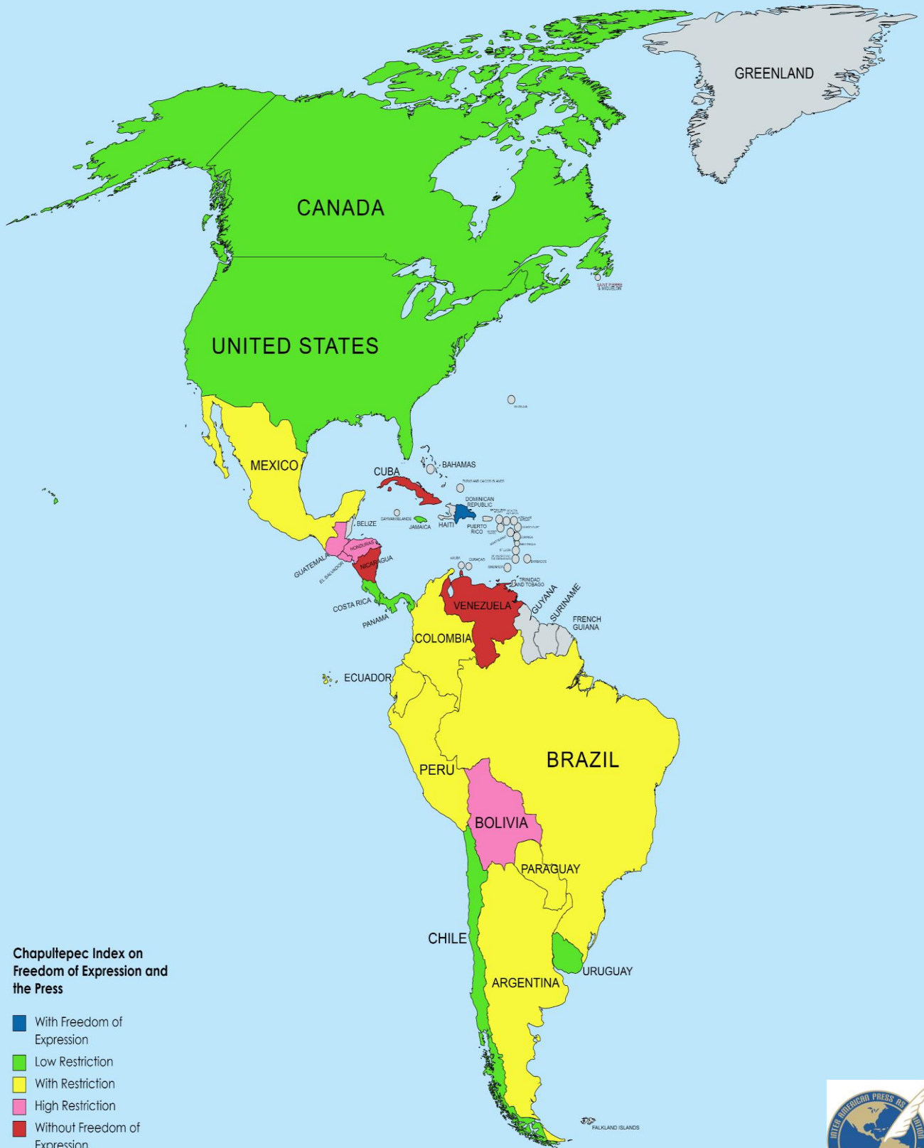
Chapultepec Index on Freedom of Expression and the Press